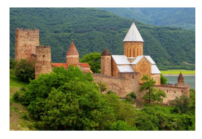
Day 8 - Tbilisi - Yerevan

Returning back to the hotel Overnight in Tbilisi