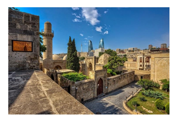
Day 3 - Gobustan - Absheron Peninsula Tour

Returning back to the hotel Overnight in Baku