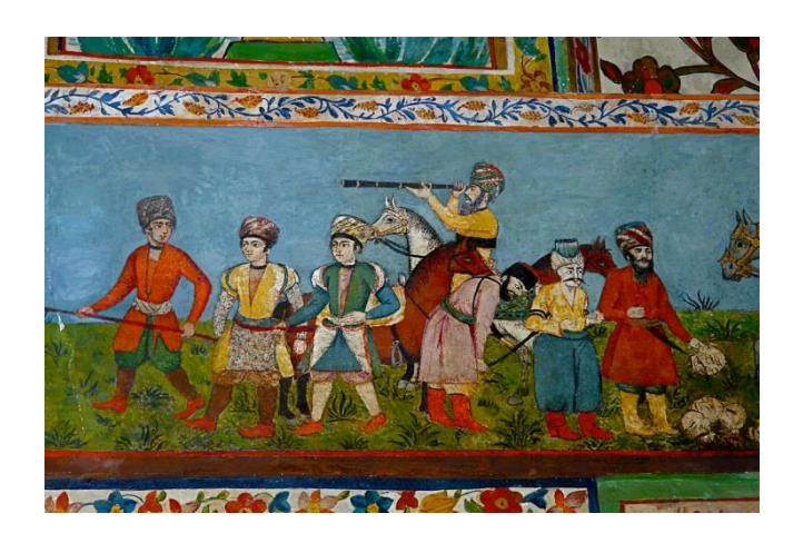
Day 5 - Sheki - Sighnaghi - Tbilisi

Returning back to the hotel Overnight in Sheki