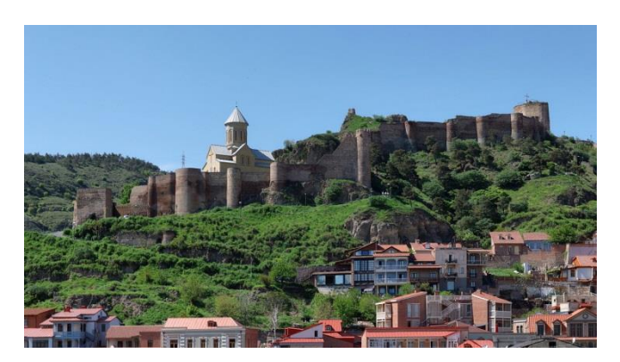
Day 7 - Tbilisi - Mtskheta - Kazbegi - Tbilisi

Returning back to the hotel Overnight in Tbilisi