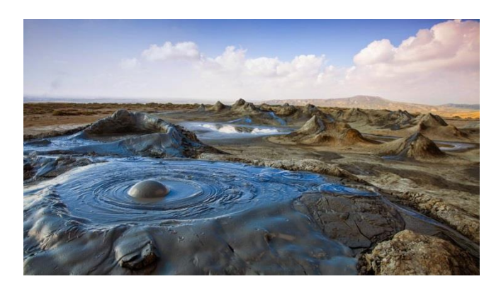
Day 4 - Baku - Sheki

Breakfast at the hotel; Check-out from the hotel Starting to Baku – Lahij route: after 1 hour drive on the way visiting Diri Baba Mausoleum – the tomb of Sufi Sheikh – in Maraza